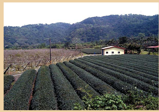
▲ Zhongshan Agricultural Leisure Area

Tour includes: Zhongshan Agricultural Leisure Areafarm experience / Choose two of them, Yilan traffic (Lunch not included.)