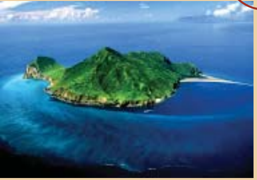
▲ Turtle Island