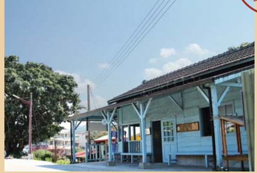
▲ Changpi Old Station