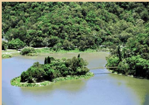
▲ Plum Blossom Lake

Note: If it rains that day ,cycling will changed Maltose Biscuit DIY